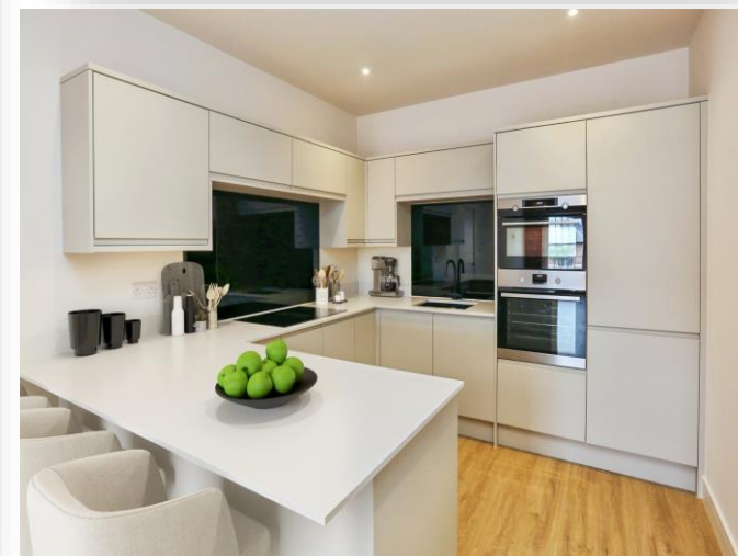
The Granary & Bakery, Weevil Lane, Gosport, PO12 1FX