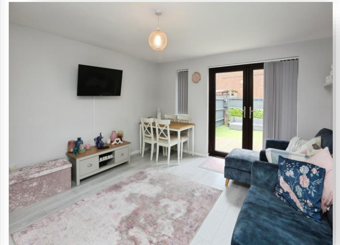
Lapthorn Close, Gosport PO13 0SR