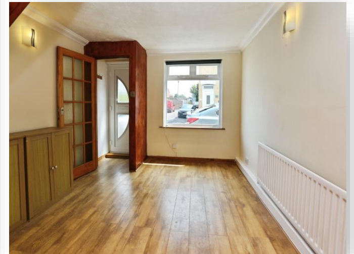
Alma Street, Gosport, PO12 3HS