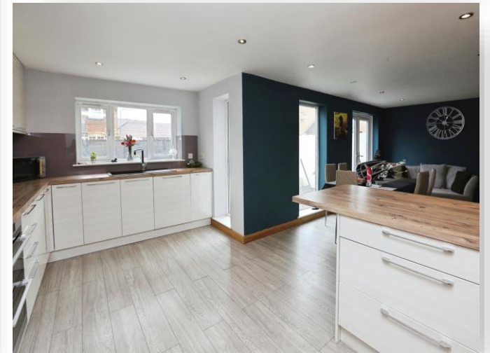
Magennis Close, Gosport, PO13 9XL