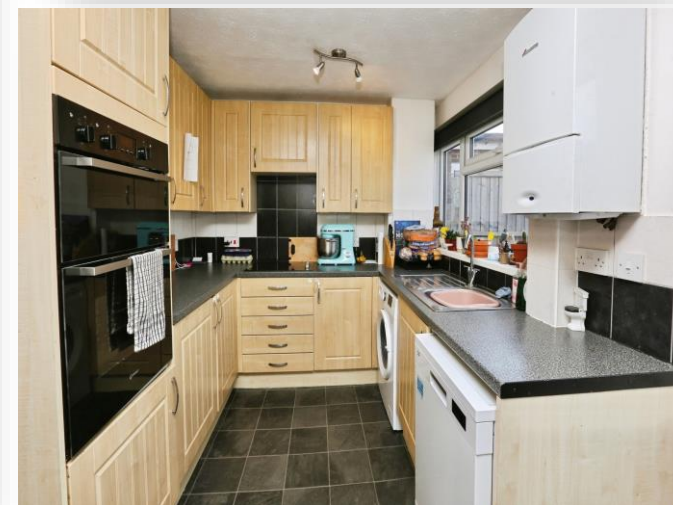
Austerberry Way, Gosport PO13 0BY