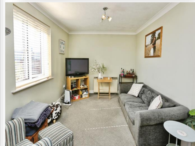
Crown Mews, Clarence Road, Gosport PO12 1DH