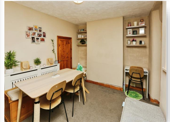
Clifton Street, Gosport, PO12 3AD