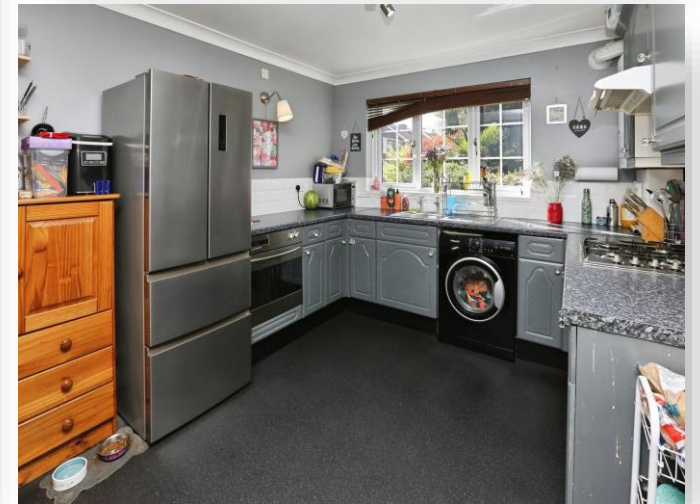
Carlton Way, Gosport, PO12 1LN