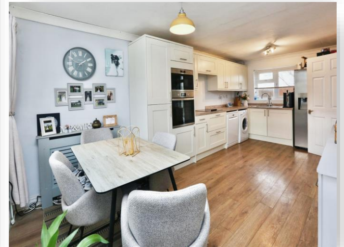
Rodney Close, Gosport, PO13 8EJ