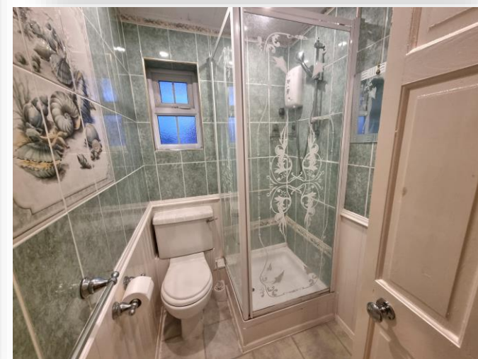
Sunbeam Way, Gosport, PO12 2BN