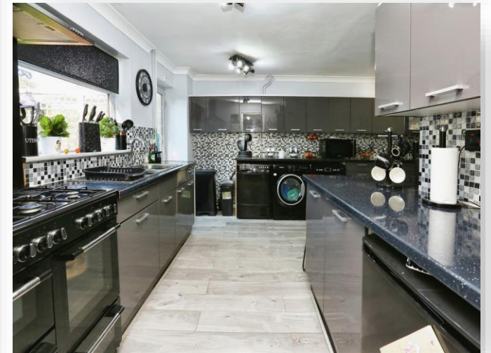
Montgomery Road, Gosport, PO13 0UZ