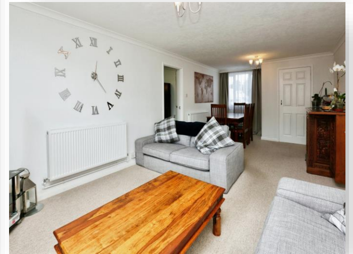
Magennis Close, Gosport, PO13 9PP