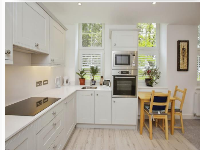
Canada House, Wakeley Drive, Gosport PO12 2FH