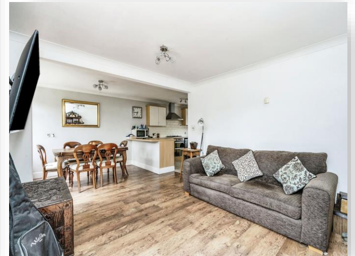
Aspengrove, Gosport PO13 0ZY