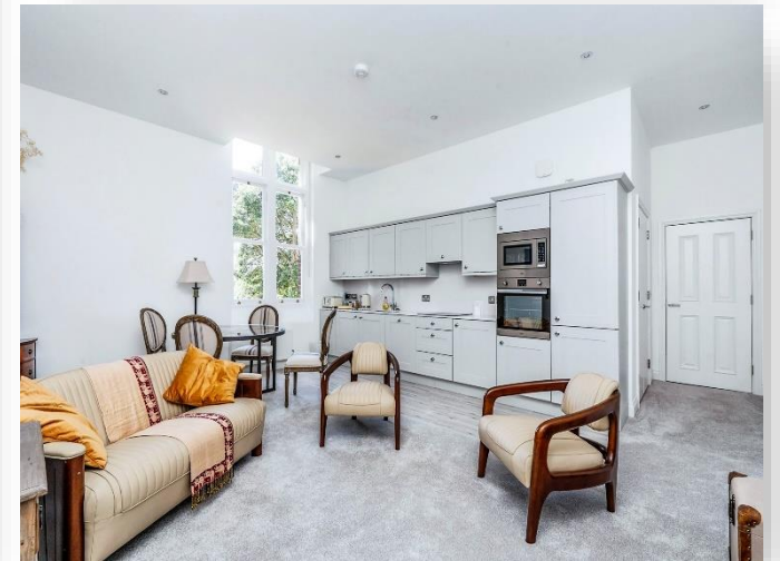
Goodrich House Huxley Way, Gosport PO12 2FF