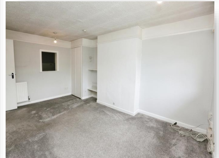
Ayling Close, Gosport PO13 9SA