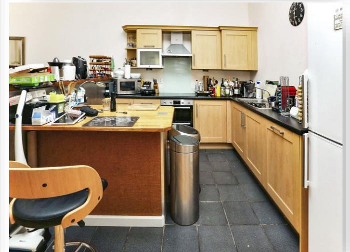
St. Georges Walk, Gosport PO12 1FH