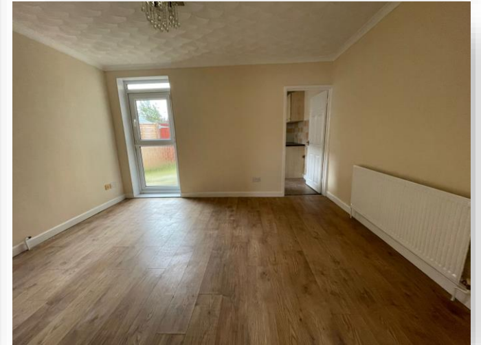
Clayhall Road, Gosport, PO12 2AJ