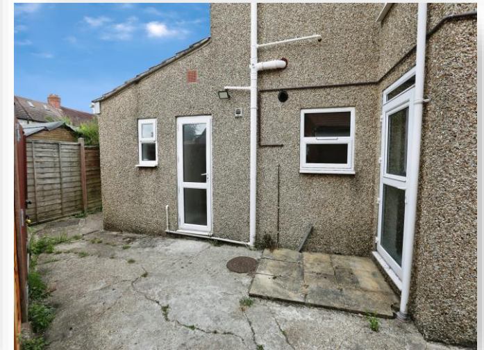
Clayhall Road, Gosport PO12 2AJ