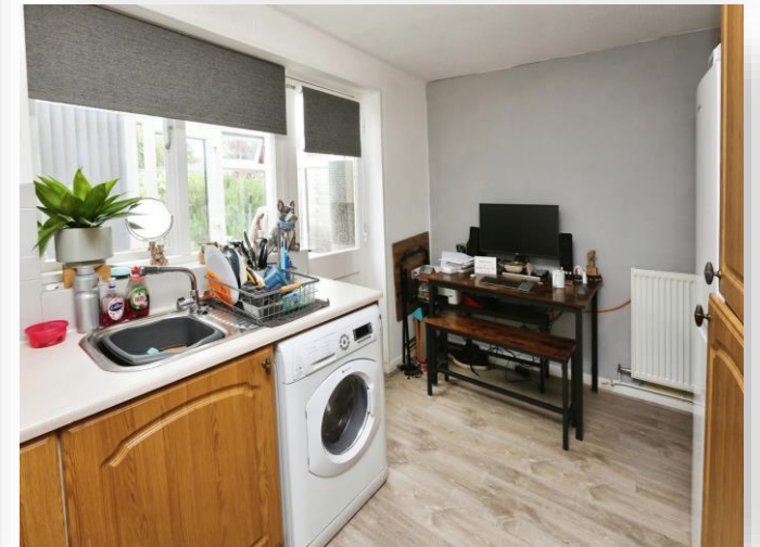
Compton Close, Lee-On-The-Solent, PO13 8JP