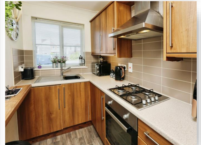
St. Faiths Close, Gosport PO12 3PP