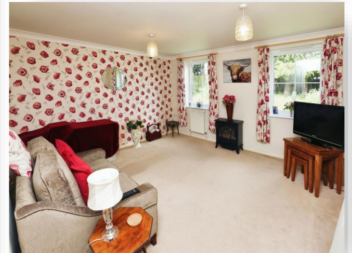
Somerset Court, Gosport PO12 4DG