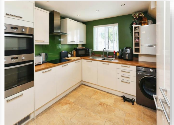
Chatfield Road, Gosport PO13 0TN