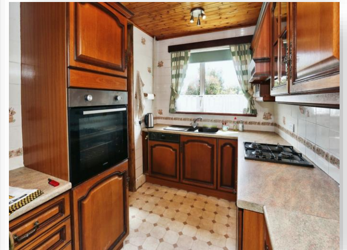
Priory Road, Gosport PO12 4LG