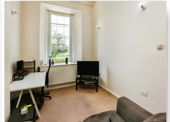
Pavilion Way, Gosport PO12 1FE