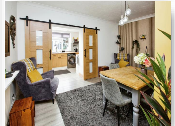
Avery Lane, Gosport, PO12 4SL