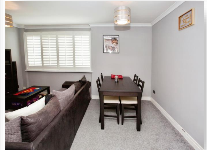
Bramshott Court Homer Close, Gosport PO13 9TL