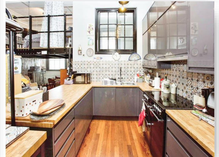
St. Georges Walk, Gosport PO12 1FH