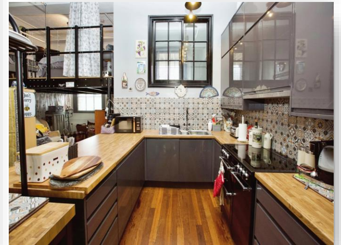
St. Georges Walk, Gosport, PO12 1FH