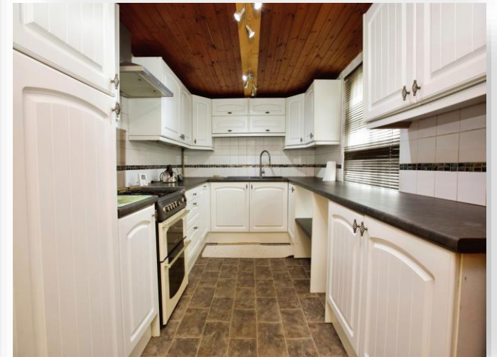
Brougham Street, Gosport PO12 3JF