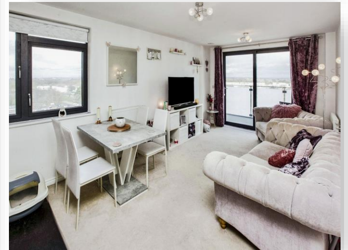
Ark Royal House, Blanchard Avenue, Gosport, PO13 8NR