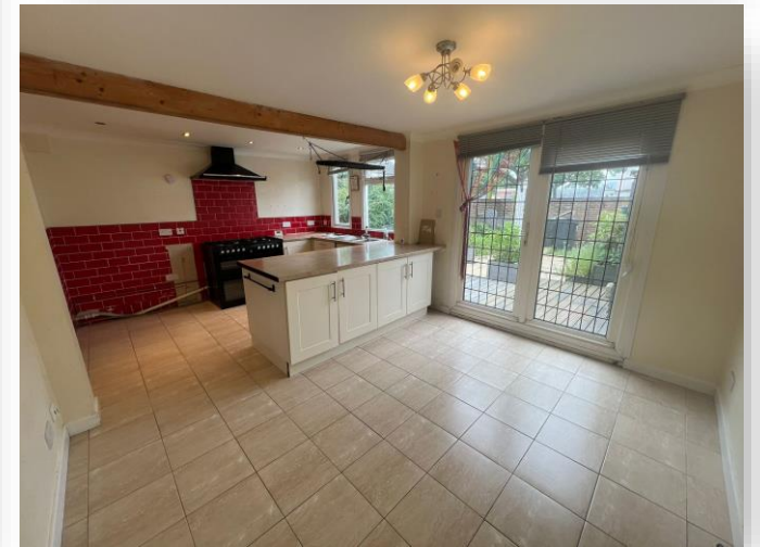
Elmore Close, Lee-On-The-Solent PO13 9ET