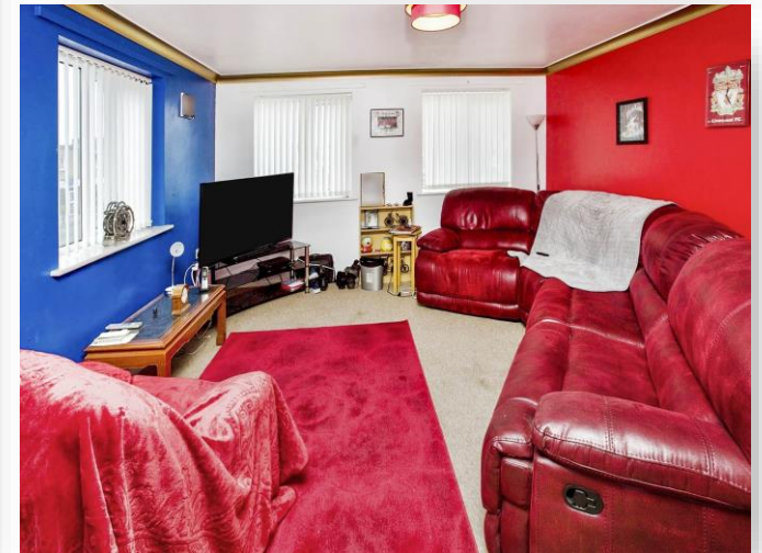
Bartons Court Forton Road, Gosport PO12 3HE