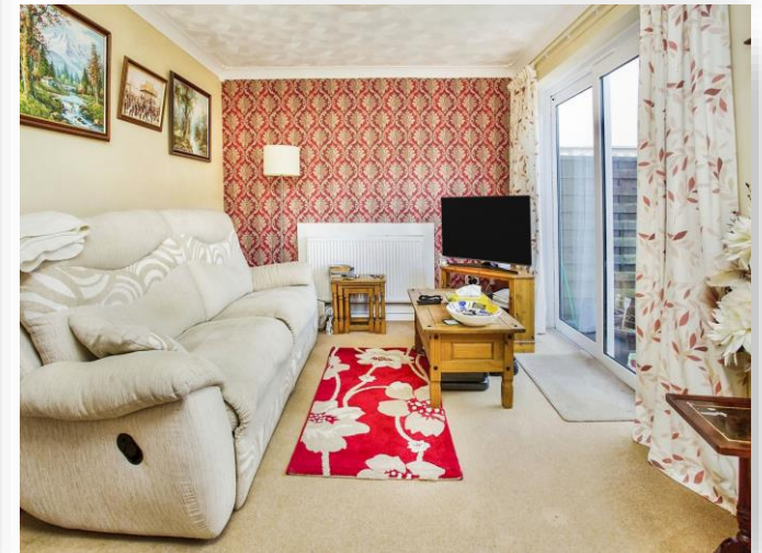
Hanbidge Walk, Gosport PO13 0UA