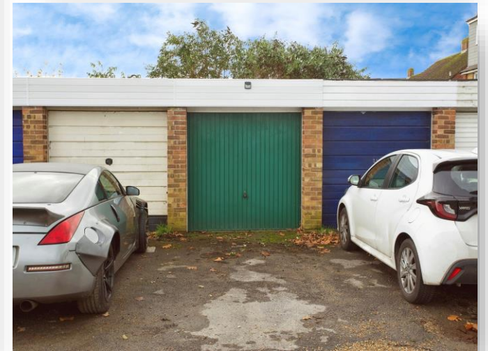
St. Christophers Gardens, Gosport PO13 0QT