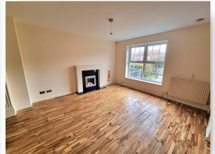
Lanyard Drive, Gosport, PO13 9UY