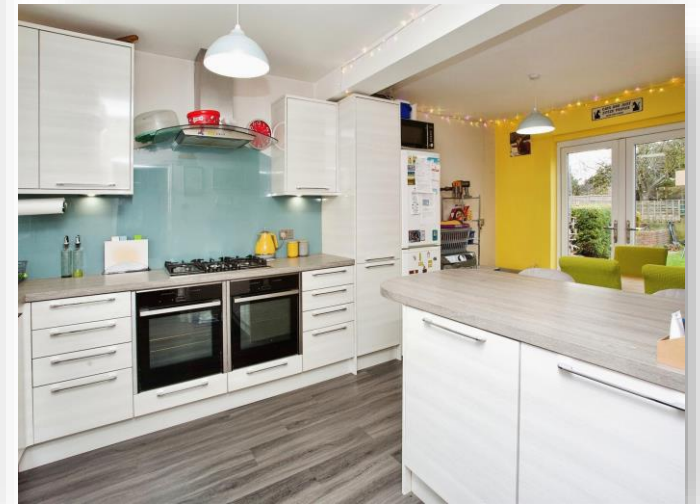
Boyd Road, Gosport PO13 0TL