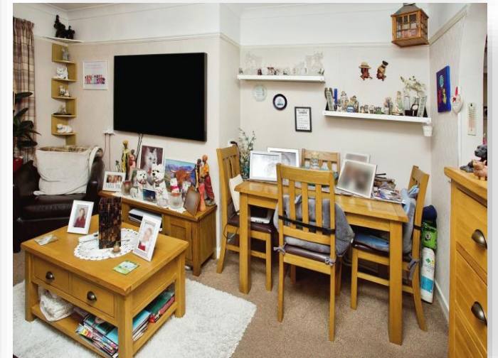
Alverstoke Court, Church Road ,Gosport, PO12 2LX