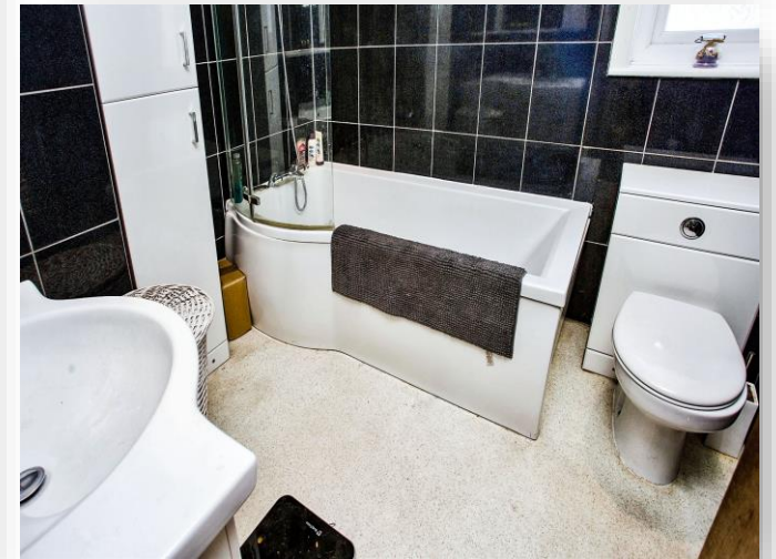
Brockhurst Road, Gosport PO12 3DG