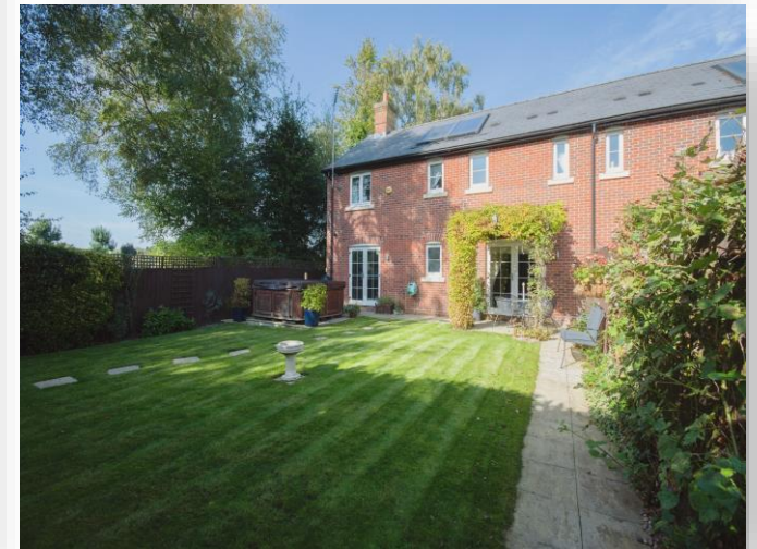
West Wick, Downton, SALISBURY, SP5 3FH