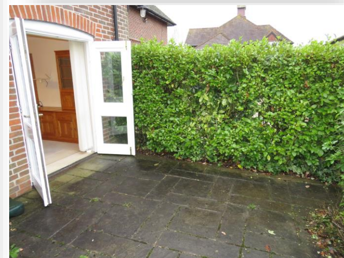
Timbermill Court, Fordingbridge SP6 1RG