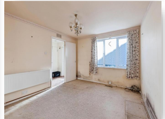
Allenwater Drive, Fordingbridge SP6 1RB