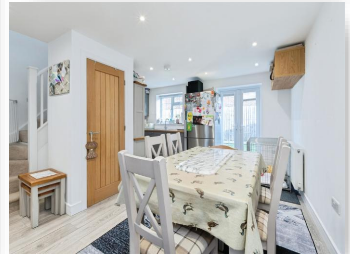
Elisa Court, Flaxfields End, Fordingbridge SP6 1FQ