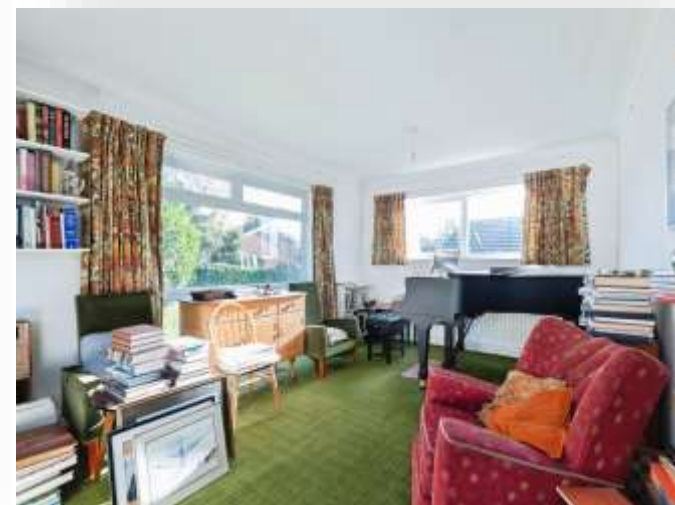
Beechwood, Fordingbridge SP6 1DB