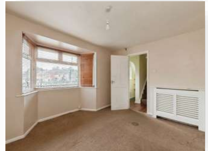
Picket Close, Fordingbridge SP6 1JU