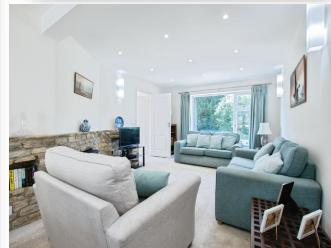
The Old Vineries, Fordingbridge SP6 1DE