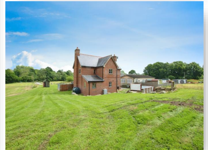
Ley Farm, Crendell, Fordingbridge SP6 3EB