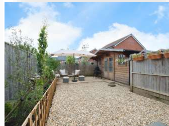
Augustus Avenue, Fordingbridge SP6 1FL