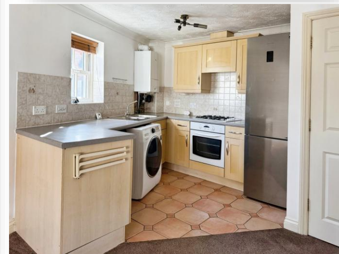
Riverside Place, Fordingbridge SP6 1RR