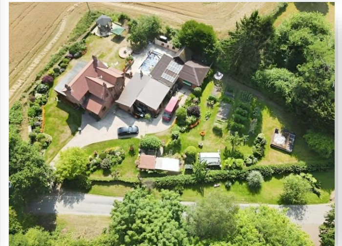
Kingbarrow View, Broxhill, Fordingbridge SP6 3DX